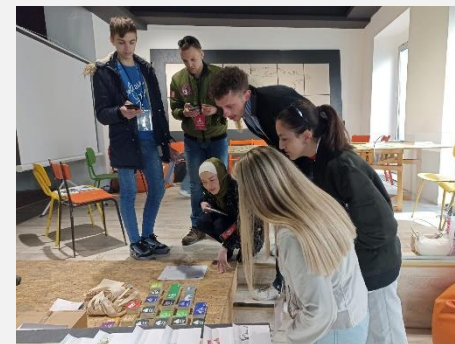
Bosnia and Herzegovina