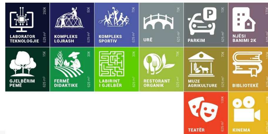
Figure 2. Infographic of the assets used in the game with the respective surface area

In order to ensure the dynamic development of the "Right to the City" a considerable commitment of the community is required. Six groups of stakeholders participate in the game: civil society for children, citizens, municipality, creative industry, land owners and investors.