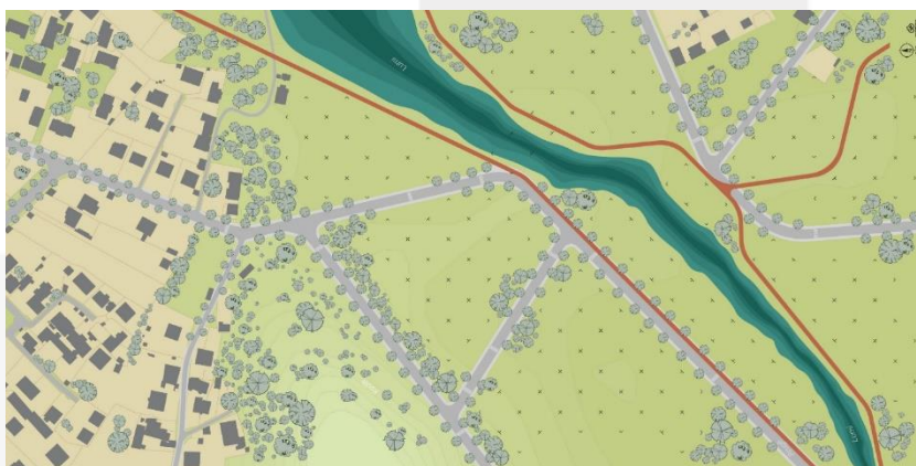
Figure 1. The site model for the gamification tool based in Shkoder, Albania

The layout for the game is adapted for a specific context in each partner country, representing realistic area, which is a subject of urban development. Space is achieved through several educational and recreational centres, which composed with the necessary elements, include accommodation units, services, as well as many very innovative green surfaces, such as green labyrinths, agricultural museums, etc.