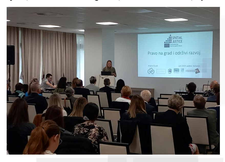
4th Conference on Urban Planning and Regional Development

Regional promotion of the project Spatial justice was held during 4th Conference on Urban Planning and Regional Development in Sarajevo, Bosnia and Herzegovina, on June 15th 2023, by REIC.